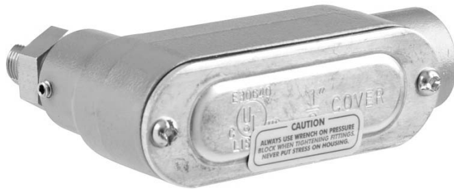
Conduit Series (LD30-S_11)

QS301030 Rev C ©2013 Flowline, Inc. All Rights Reserved Made in USA