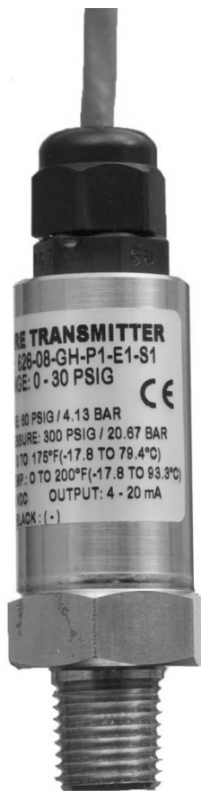
Cable Series (LD30-S_01)